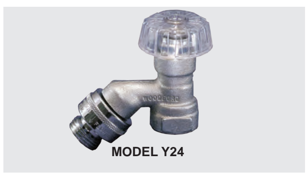
Exterior Finish: Standard - Chrome (CH) Optional- Rough Brass (BR) or Polished Chrome (PC)