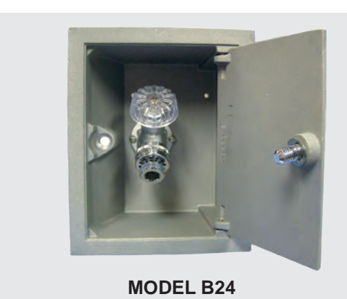
Exterior Finish: Standard - Chrome (CH) Optional- Rough Brass (BR) or Polished Brass (PB) Other Options: Anodized Aluminum Box (AL)