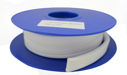
Matrix L120 Joint Sealing