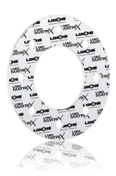
Matrix L120 Sheet Gasket