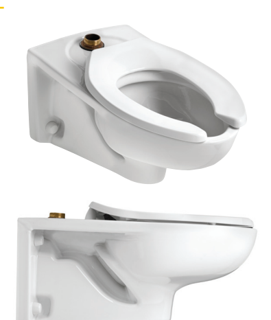
New Afwall Millennium